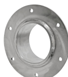
SLF RS sleeve

For detailed information, please visit roxtec.com .